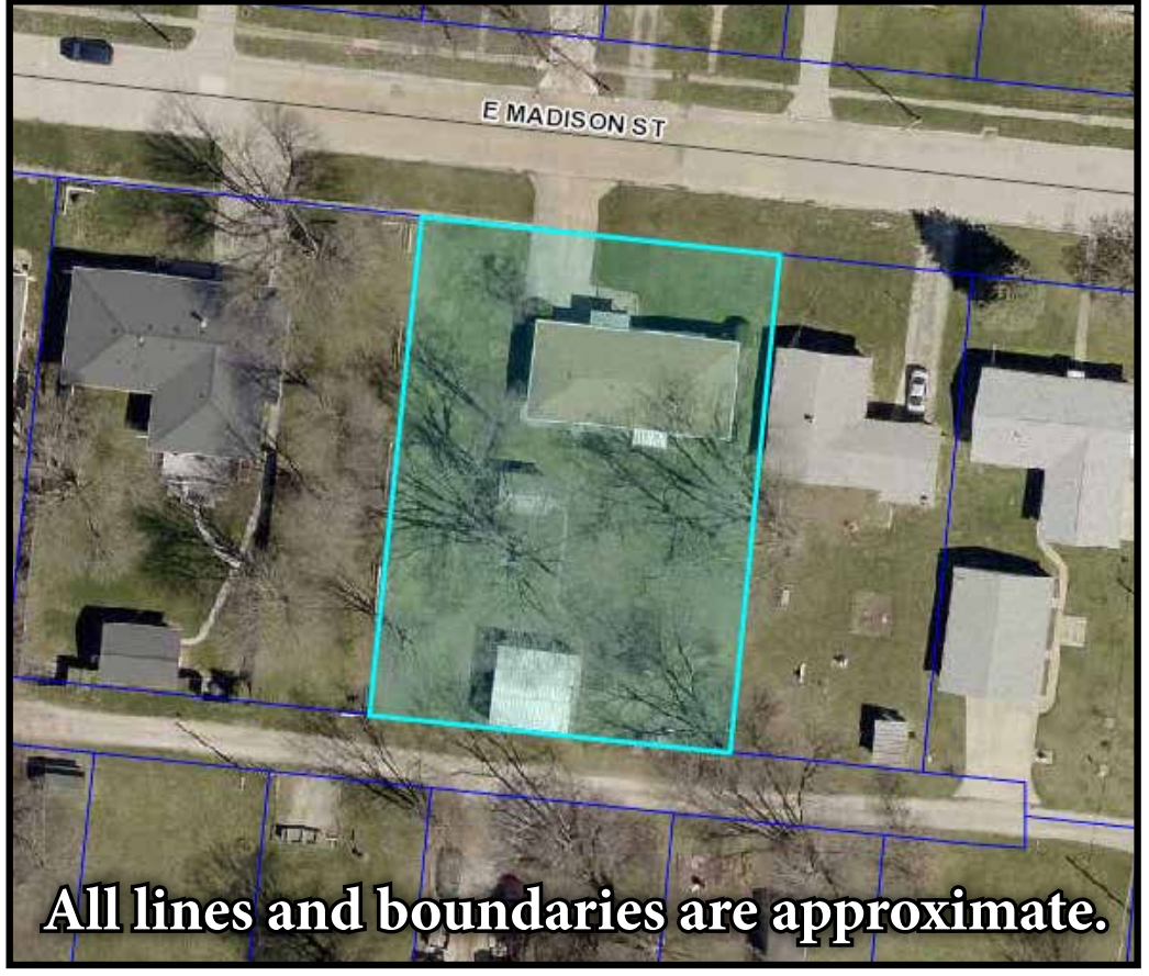
All lines and boundaries are approximate.