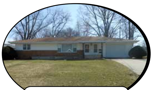
Mt. Pleasant, Iowa